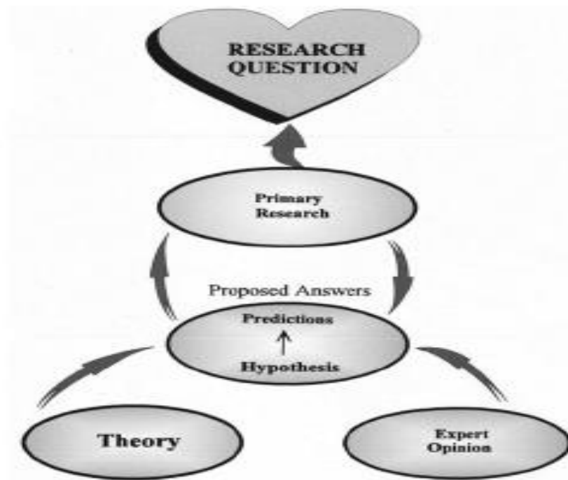
FIG. 1.2. Sources for answers to research questions.